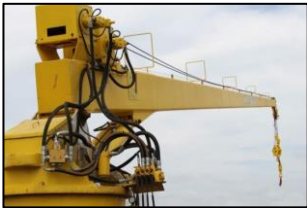
Telescopic Boom (5 ton to 100 ton)