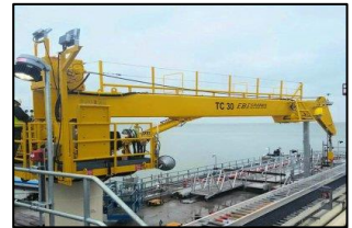
Fixed Boom (2 ton to 100 ton)