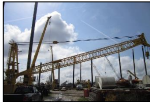
Lattice Boom (10 ton to 250 ton)