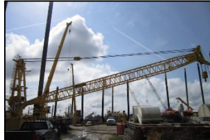
Lattice Boom (10 ton to 250 ton)