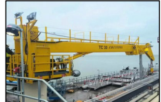
Fixed Boom (2 ton to 100 ton)