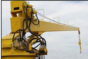
Telescopic Boom (5 ton to 100 ton)