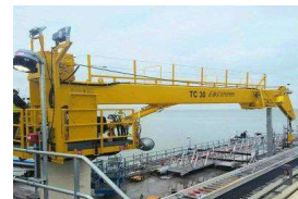
Fixed Boom (2 ton to 100 ton)