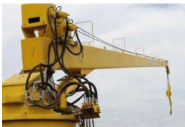
Telescopic Boom (5 ton to 100 ton)