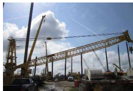
Lattice Boom (10 ton to 250 ton)